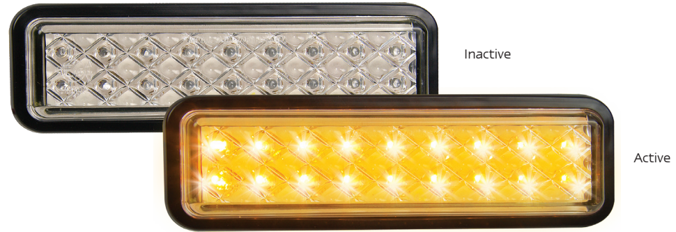
Front Indicator Lamp 135CAT1G - Blister, 12 Volt, Recessed Grommet Mount