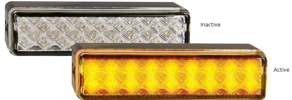
Front Indicator Lamp 135CAT1 - Blister, 12 Volt, Surface Mount 135CAT1B - Bulk, 12 Volt, Surface Mount 135CAT124 - Blister, 24 Volt, Surface Mount 135CAT124B - Bulk, 24 Volt, Surface Mount